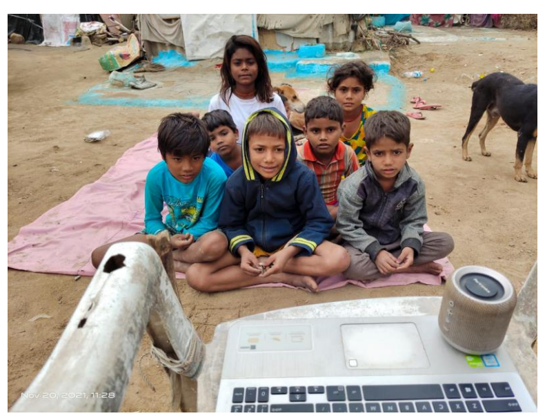
Children of Slum watching the online session