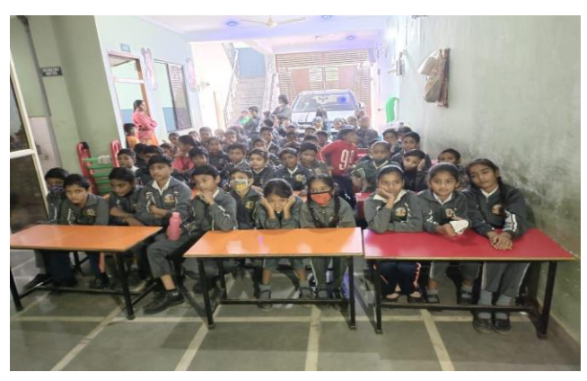
Students of Kids World School, Gwalior watching the online session