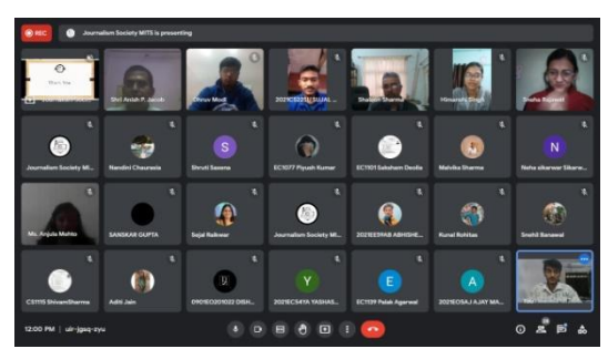
Snapshot of Google Meet Session of the event